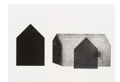
3. Close distance 75.5 x 55.5cm Limited edition of 10 UNFRAMED $460 inc GST FRAMED $760 inc GST