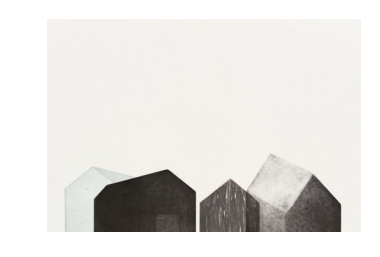
4. We'll be alright 49.5 x 70cm Limited edition of 10 UNFRAMED $460 inc GST FRAMED $760 inc GST