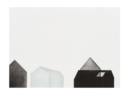
1. I'll hold onto that 75.5 x 55.5cm Limited edition of 10 UNFRAMED $460 inc GST FRAMED $760 inc GST