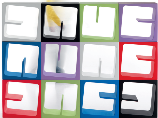
Libreria modulare | Modular bookcase | Bücherregalmodul Bibliothèque modulaire | Biblioteca modular