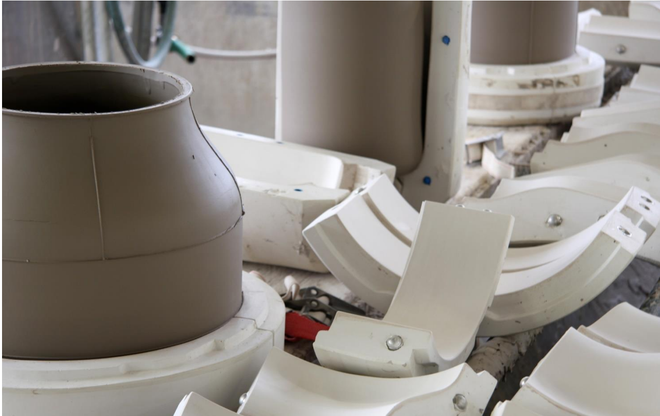
Seams & Canisters by Benjamin Hubert