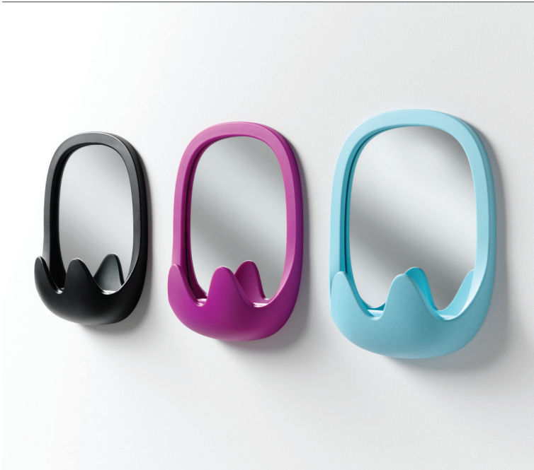
Specchio / contenitore | Mirror / container | Spiegel / Behälter Miroir / rangement | Espejo / contenedor