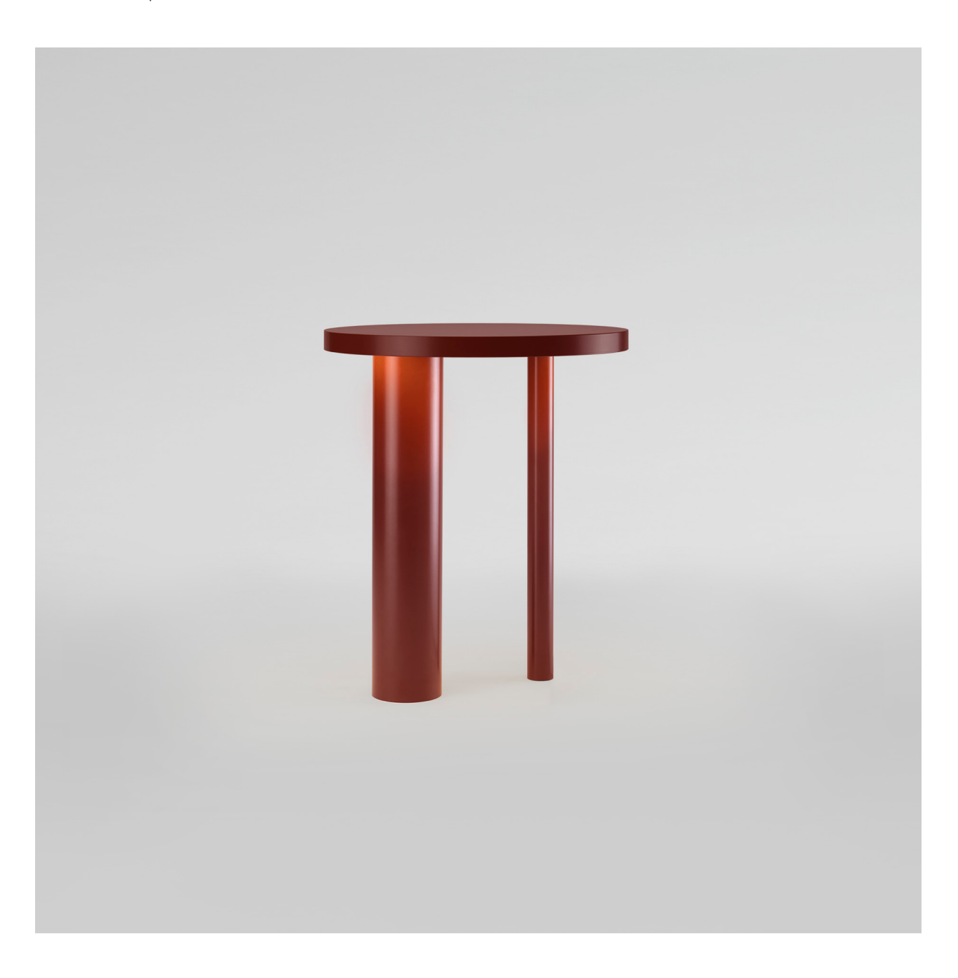
Table Composition, 2017