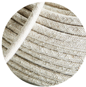
NATURAL GREY LINEN