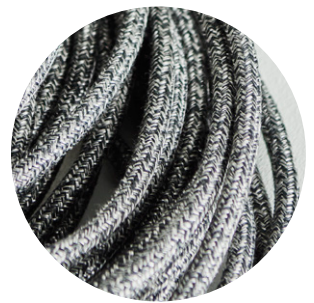
DARK GREY LINEN