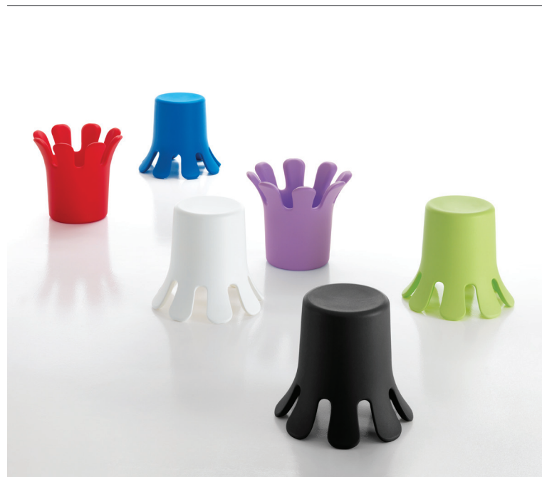
Sgabello-vaso | Stool-vase | Schemel-Vase Tabouret-vase | Taburete-jarrón