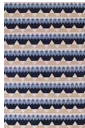
Mountain Spot in grey