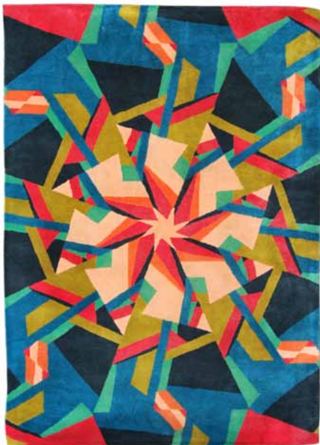
Scope in blue/pink