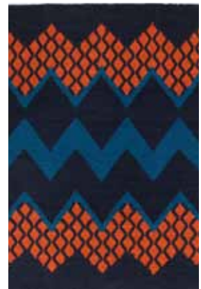
Fairisle in peacock/orange