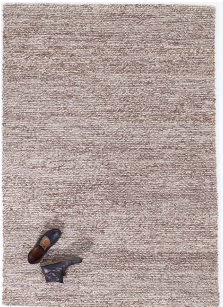
Purl in natural