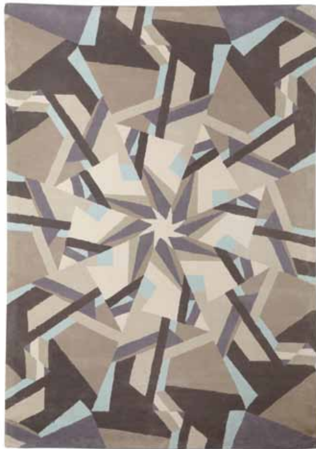
Scope in smoky grey