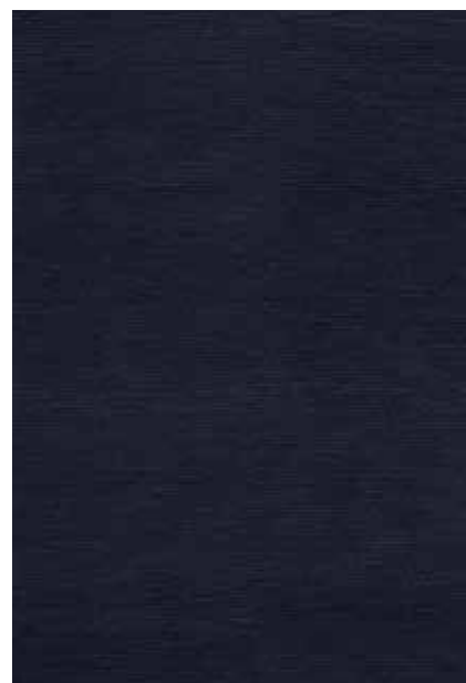
Purl in dark grey