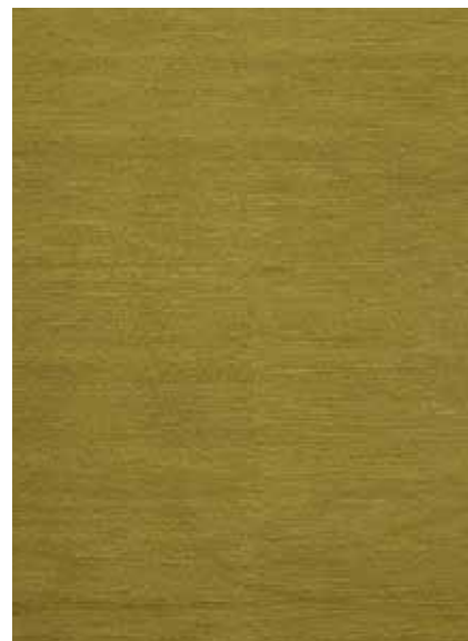
Purl in mustard