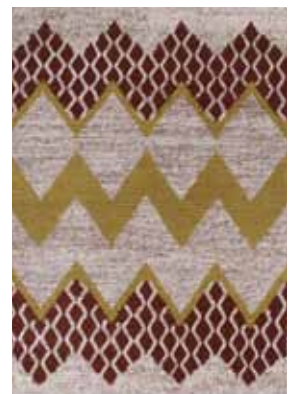
Fairisle in natural/brown