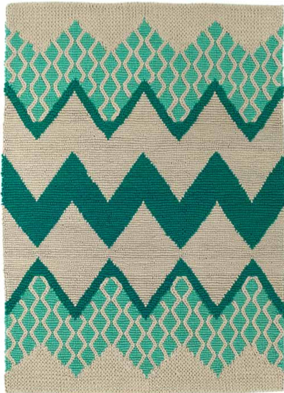
Fairisle in Mineral Grey