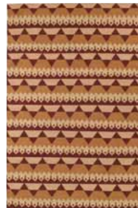
Mountain Spot in Warm Autumn