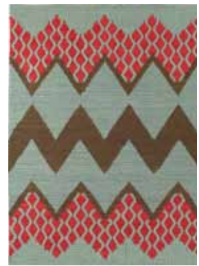
Fairisle in Rose Cloud