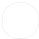
Solid surface white 3mm X035