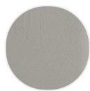
Reconstructed stone white Calce X131