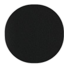
Reconstructed stone black slate X132