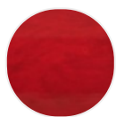
Diamond, glossy red X121