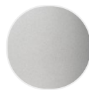
Reconstructed stone X084