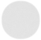
Matt painted white X053