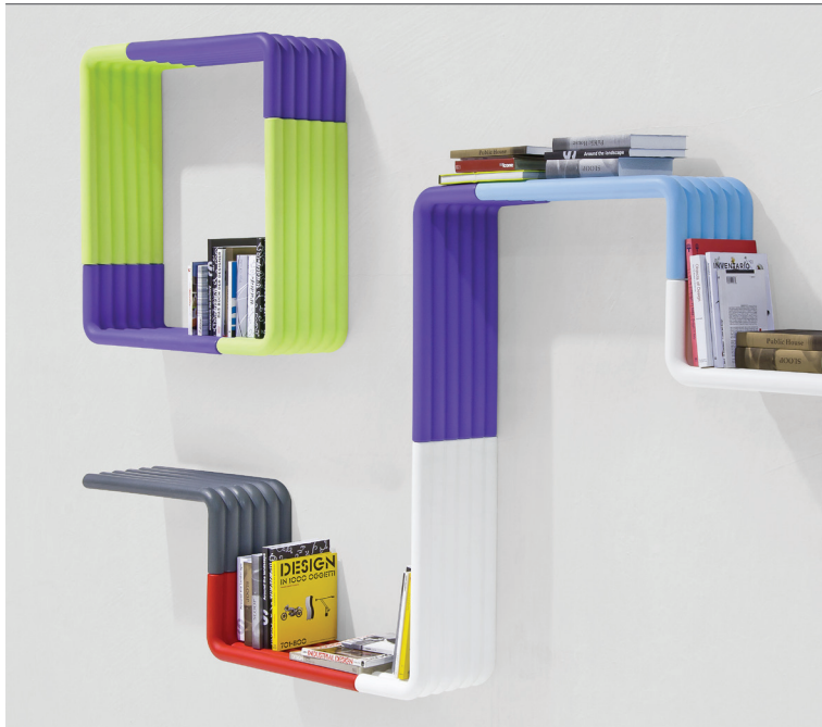
Mensola modulare | Modular shelf | Regalmodul Étagère modulaire | Repisa modular