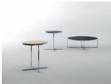
HOLY DAY table