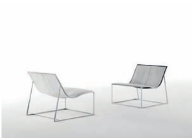
HOLY DAY armchair