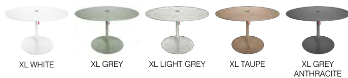
XL WHITE XL GREY XL LIGHT GREY XL TAUPE XL GREY ANTHRACITE