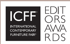
Best Seating 2001: Alfa

A shiny geometric chair designed by Hannes Wettstein in composite material with added fibreglass. Alfa can also be in soft-touch finish (introduced in 2009), making this Molteni&C classic yet more versatile. The soft-touch is a polyurethane finish whose final effect is a surface pleasant to the touch.